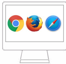
PC and Mac Chrome | Firefox | Safari

1 Use a computer or device with camera/microphone